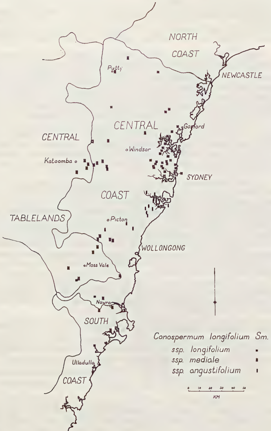
MAP 1. Distribution of Conospermum longifolium Sm.